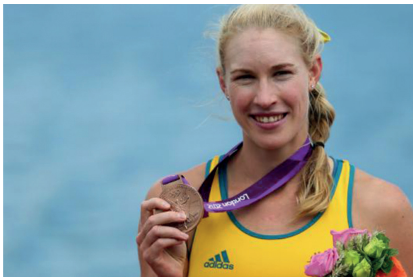
Kim Brennan - London 2012 Olympics