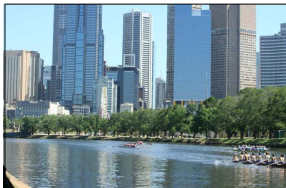
The race heads down the Yarra river through the centre of Melbourne.